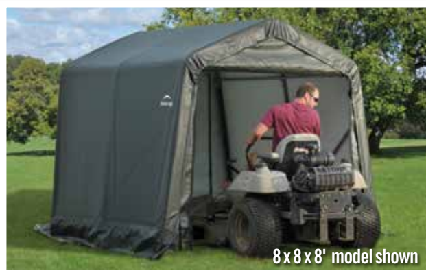
8x8x8' model shown

Thousands of options to custom fit your storage needs.