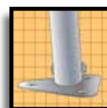
Steel foot plates